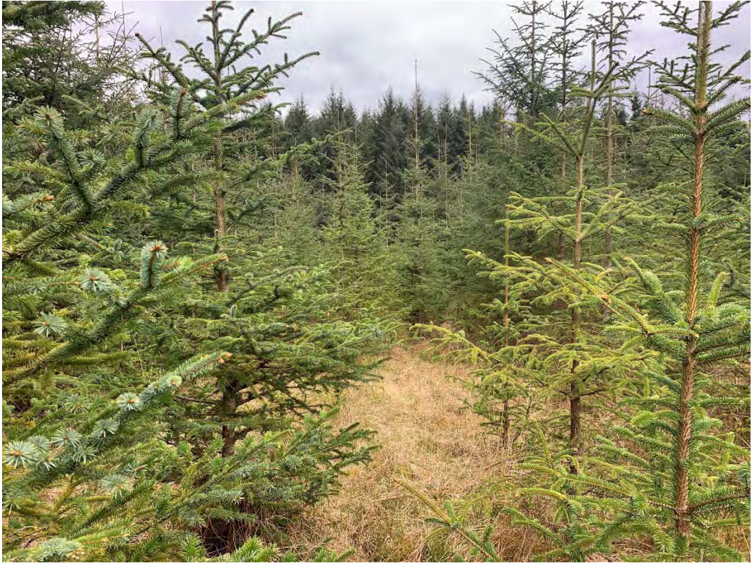
Figure 2.14: Turbine T8 location (subcompartment 0038A)