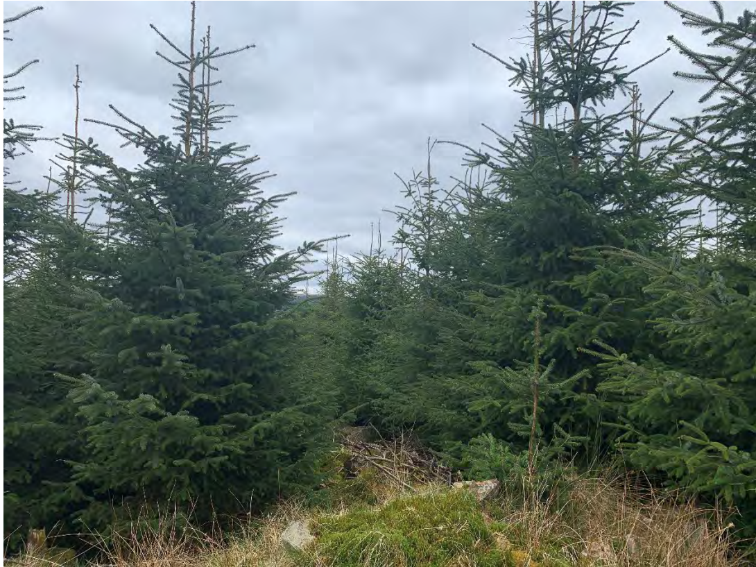
Figure 2.22: Turbine T11 location (subcompartment 0049A – note that this subcompartment is considered representative of subcompartments 0049A1 and 0056A)