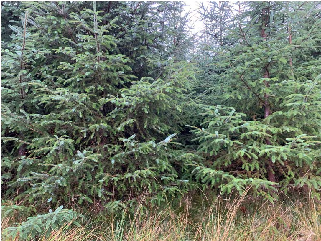
Figure 2.23: Borrow pit 1 location (subcompartment 0042A – note that this subcompartment is considered representative of subcompartments 0046A1 and 0046A1)