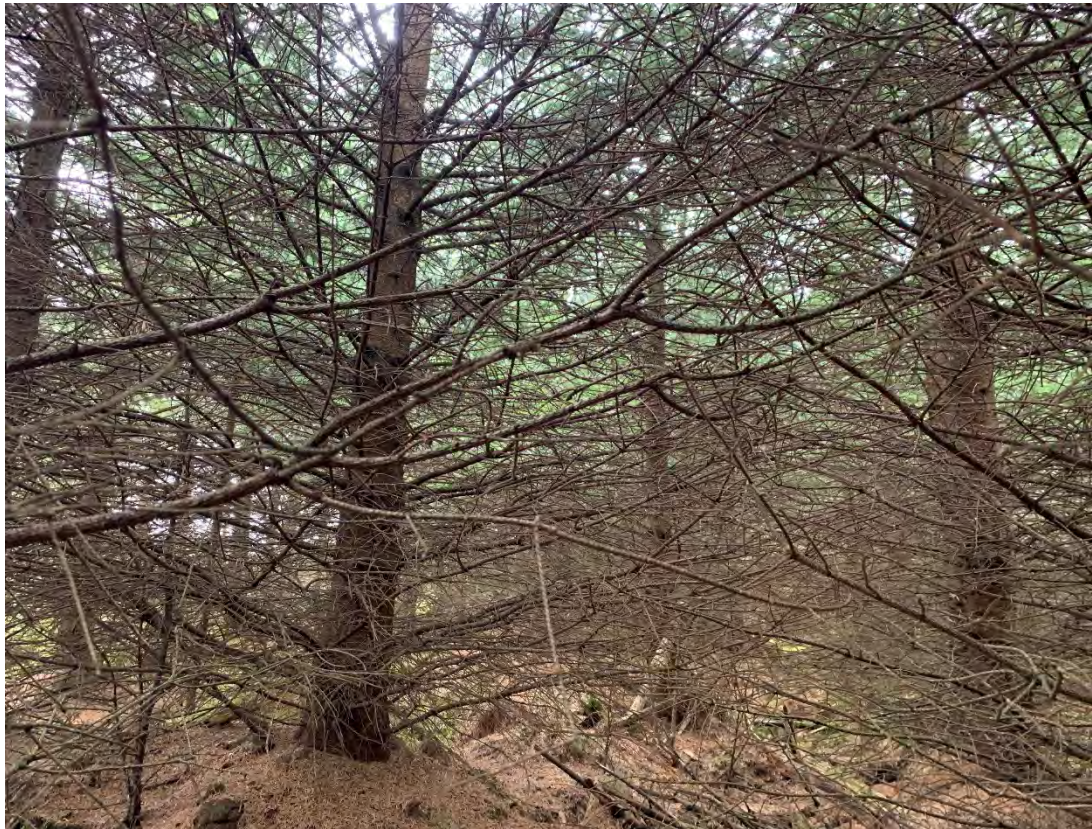
Figure 2.2: Turbine T2 location (subcompartment 0008A1)