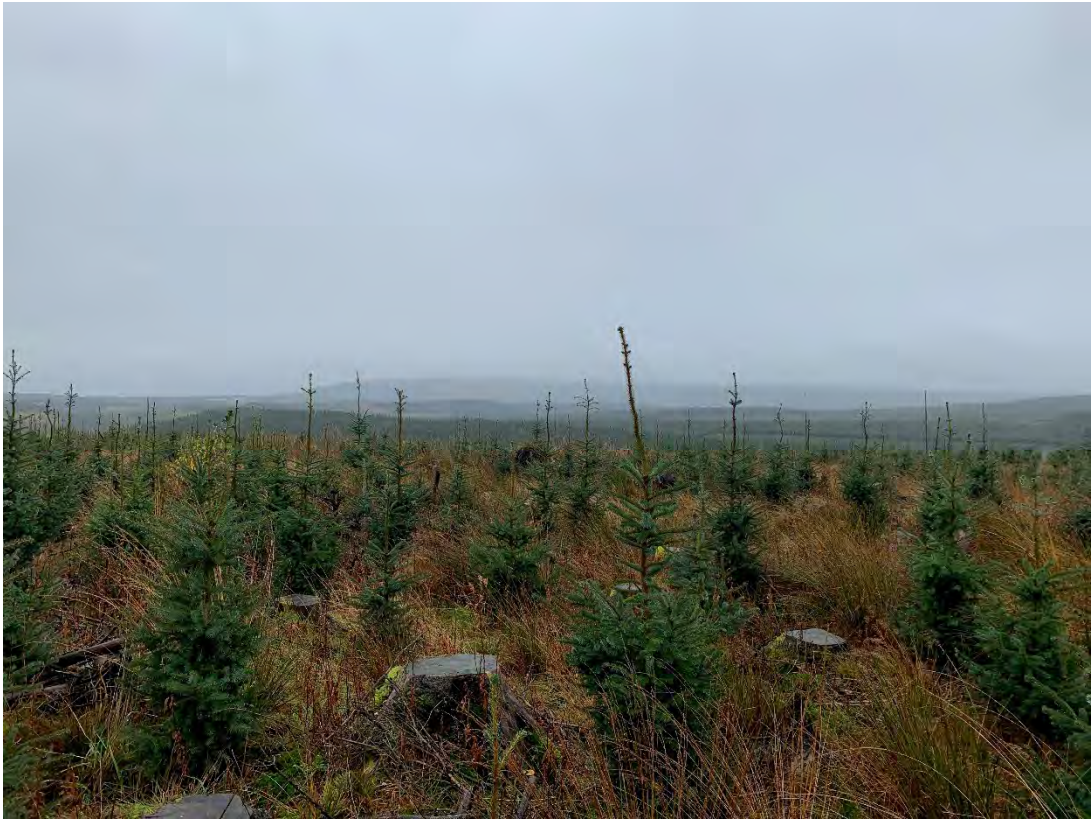
Figure 2.12: Turbine T7 location (view south) (subcompartments 0032A)