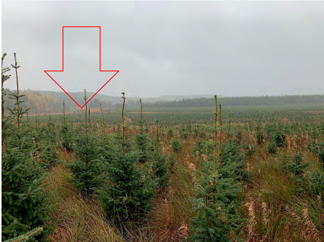
Figure 2.28: View east towards preferred substation (indicated by arrow) location from construction compound location. (subcompartment 0012A – note that this subcompartment is considered representative of subcompartments 0011A and 0012A1)

The timber quality in the preferred substation location is similar to that in the construction compound location, as shown in Figure 2.28 .