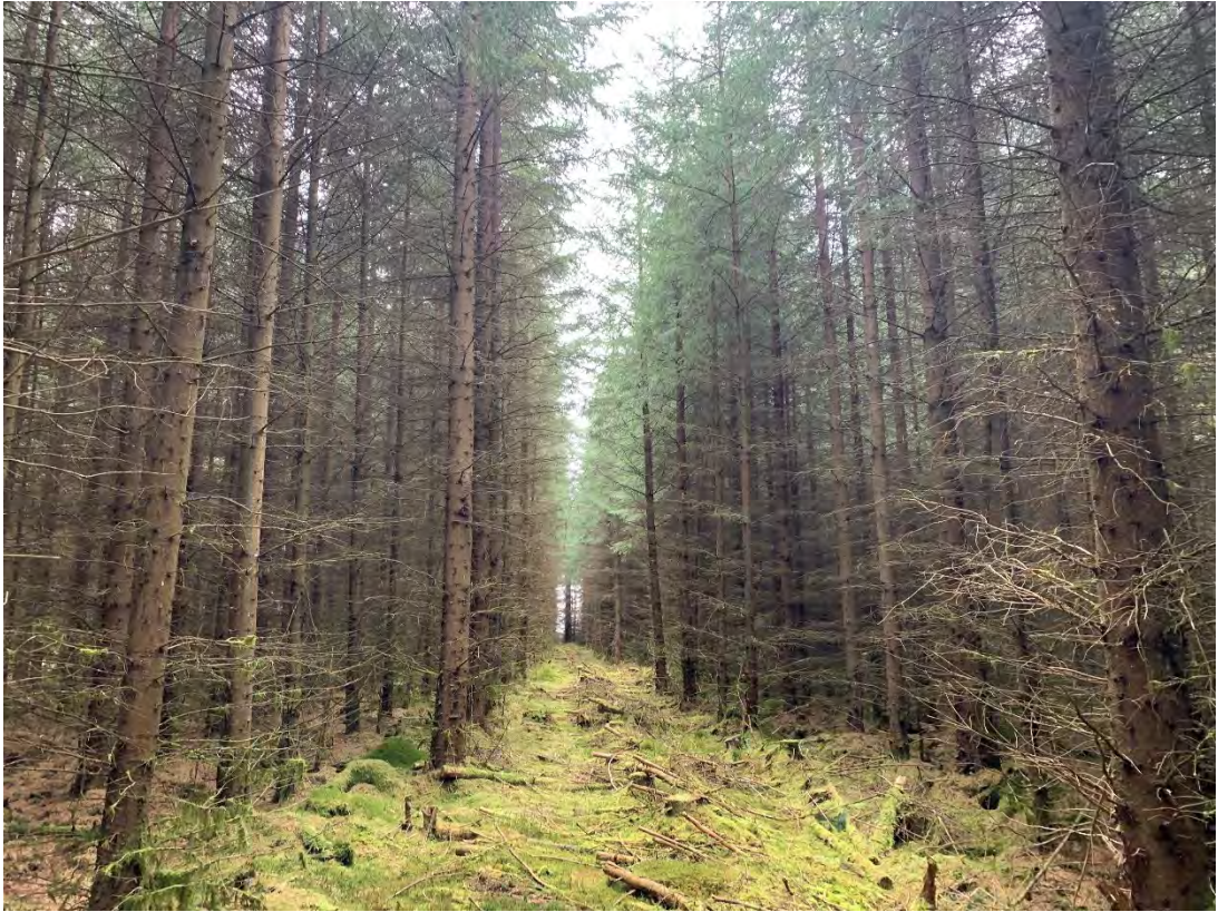
Figure 2.37: Area 4 and 5 location (subcompartment 56015)