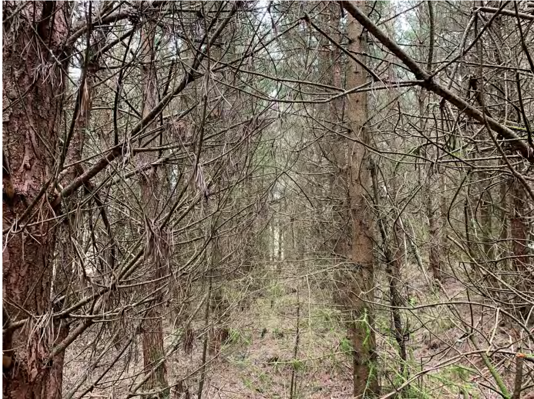
Figure 2.35: Area 2 location (subcompartment 56014)