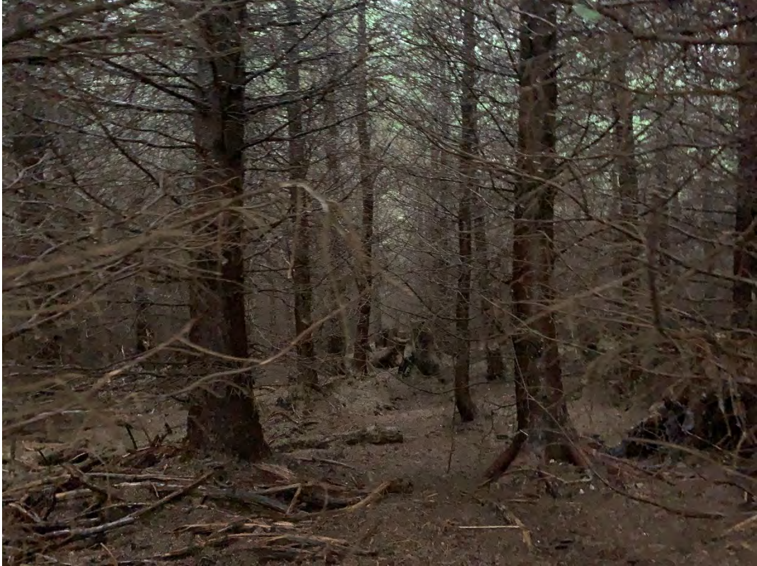
Figure 2.17: Turbine T10 location (internal – this photo has been included as timber conditions are difficult to observe from the original photo location shown in Figures 2.18 to 2.21) (subcompartment 0048A1 – note that this subcompartment is considered representative of subcompartments 0047A and 0048A)