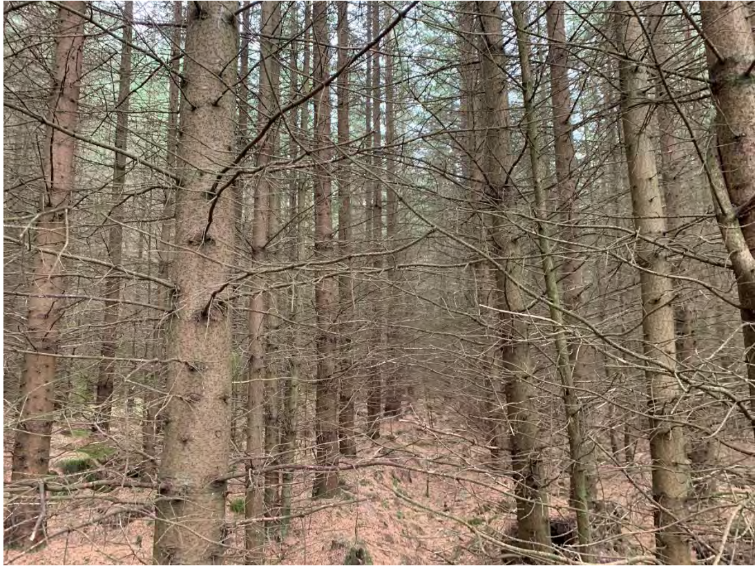
Figure 2.36: Area 3 location (subcompartment 56015)