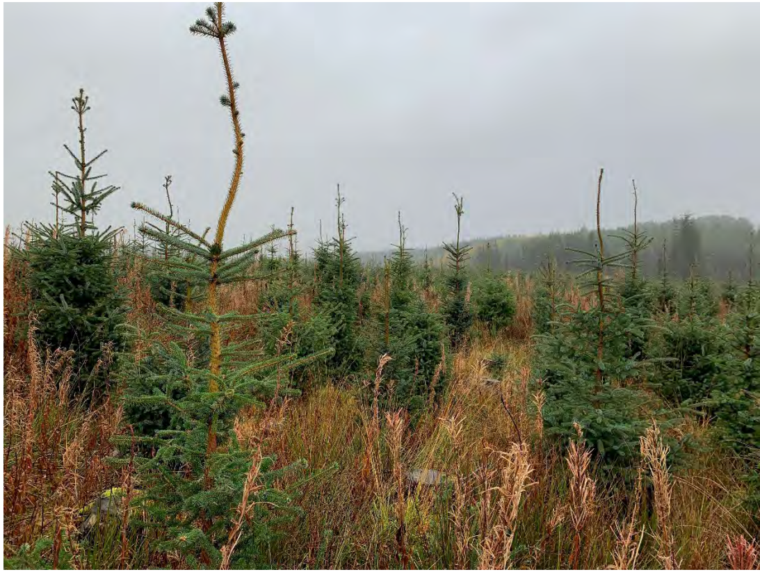
Figure 2.31: Construction compound location (view south) (subcompartment 0012A)