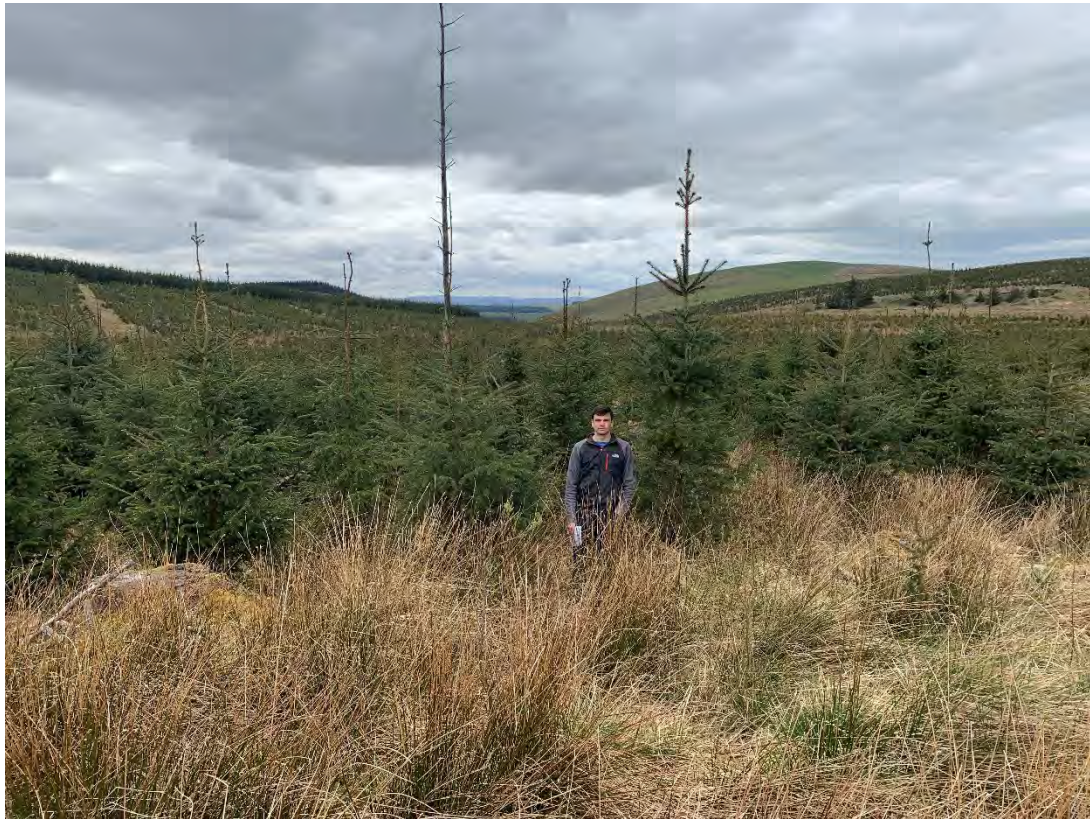
Figure 2.16: Turbine T9 location (subcompartments 0040A5 and 0059A)