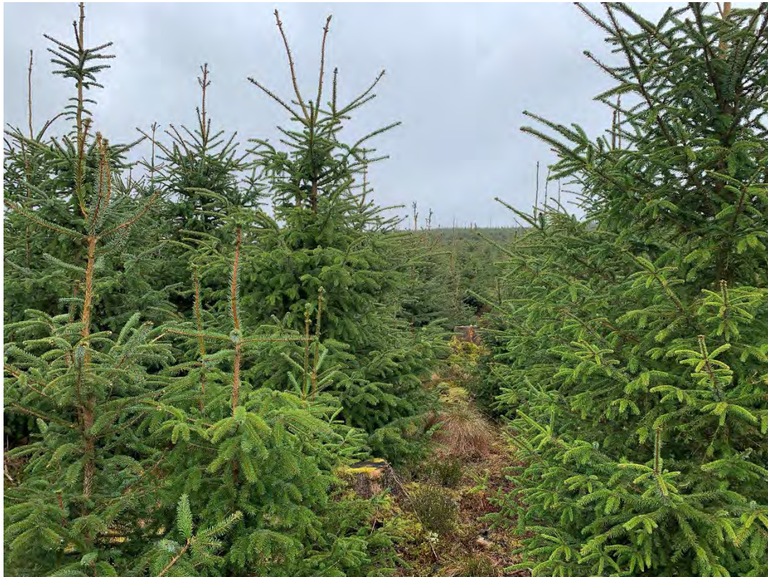
Figure 2.1: Turbine T1 location (subcompartment 0003A)