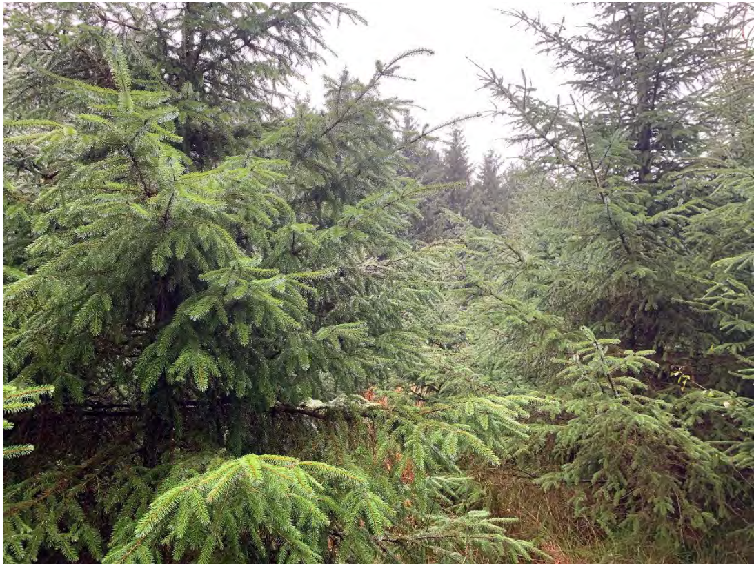
Figure 2.24: Borrow pit 2 location (view north) (subcompartment 0016A)