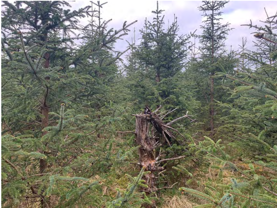
Figure 2.9: Turbine T5 location (subcompartment 0051A)