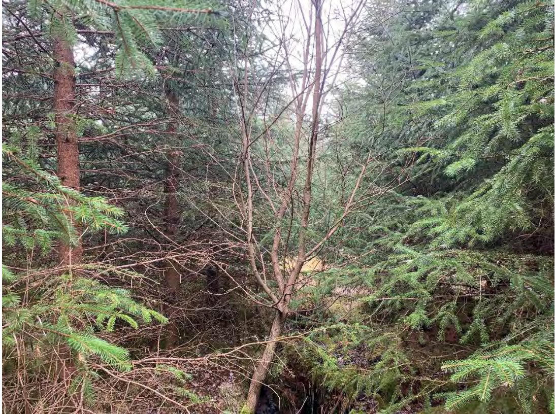
Figure 2.4: Turbine T3 (subcompartment 010A)