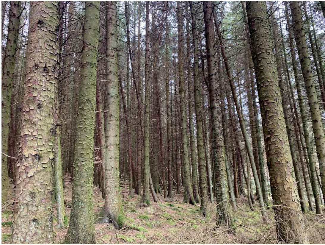
Figure 2.34: Area 1 location (subcompartment 56013)