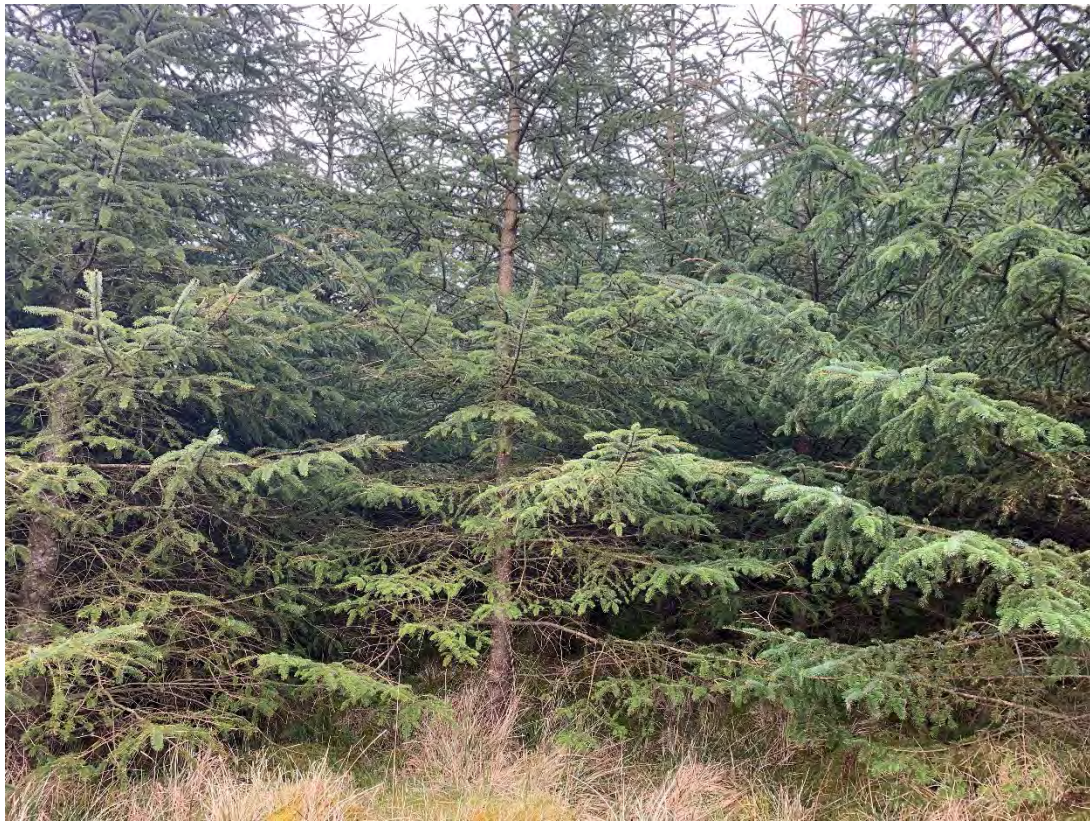
Figure 2.29: Alternative substation location (subcompartment 0041A2 - note that this subcompartment is considered representative of subcompartment 0041A)