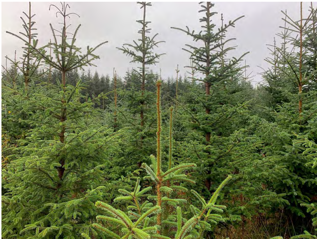
Figure 2.5: Turbine T4 location (view north) (subcompartment 0017A)