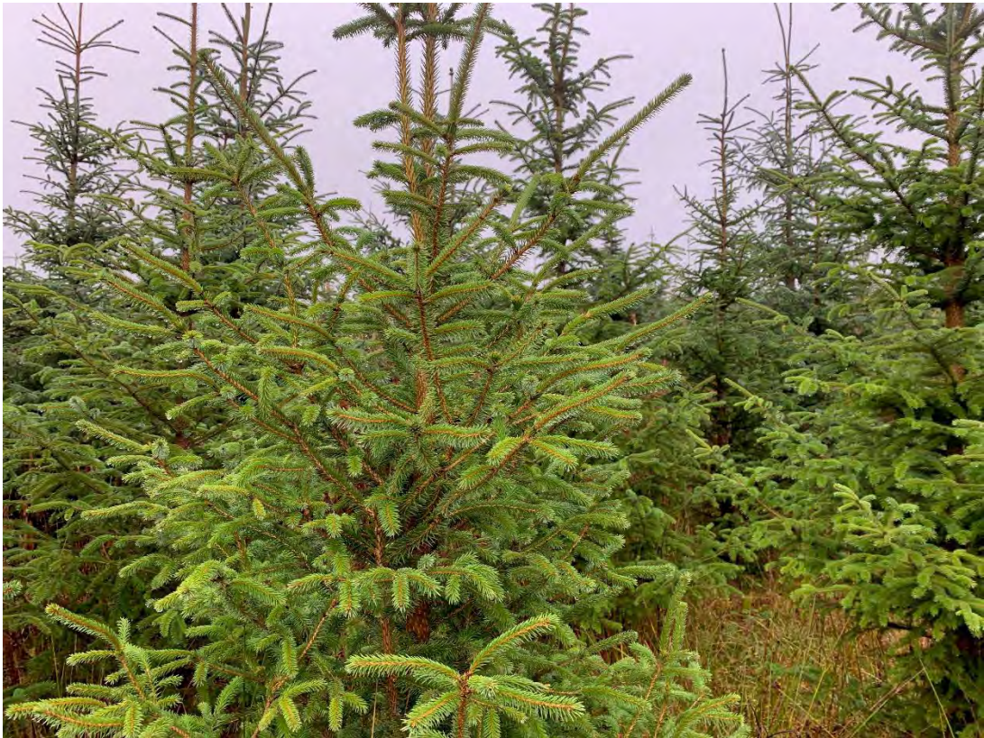
Figure 2.7: Turbine T4 location (view south) (subcompartment 0017A)