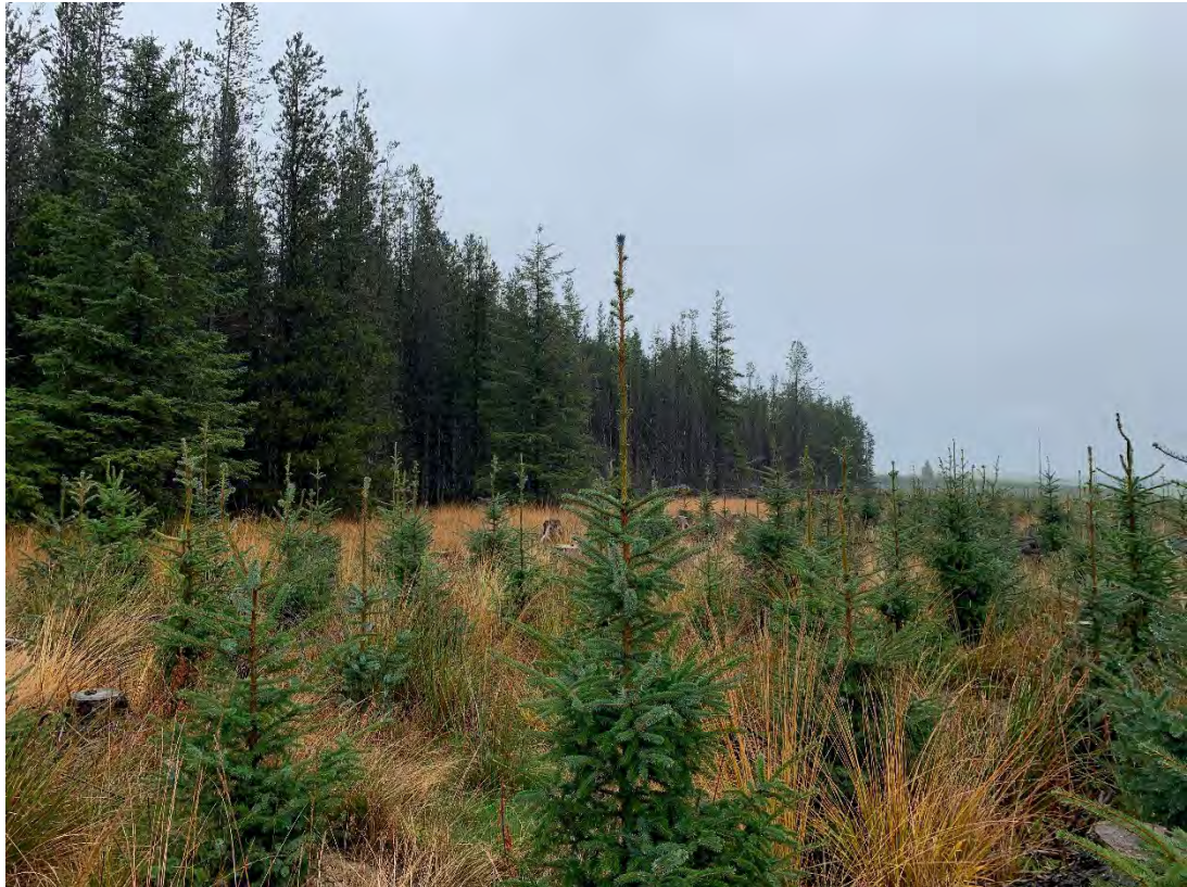
Figure 2.10: Turbine T7 location (view east) (subcompartments 0032A – mature forestry to left of photo is a separate subcompartment and would not be felled as part of the Proposed Development)