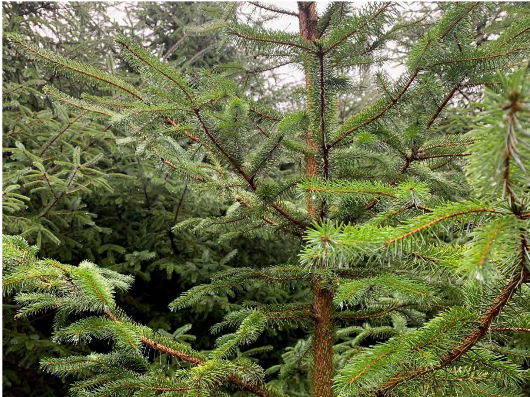
Figure 2.26: Borrow pit 2 location (view south) (subcompartment 0016A)